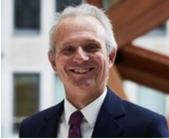
The Rt Hon David Lidington CBE MP Chancellor of the Duchy of Lancaster and Minister for the Cabinet Office