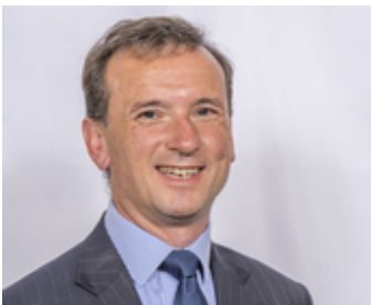
The Rt Hon Alun Cairns MP Secretary of State for Wales