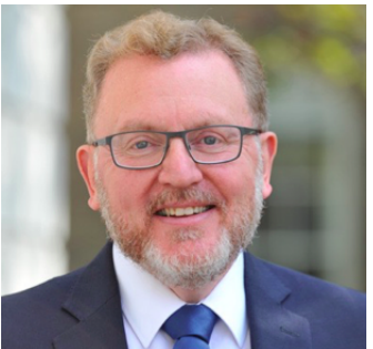
The Rt Hon David Mundell MP Secretary of State for Scotland