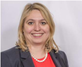
The Rt Hon Karen Bradley MP Secretary of State for Northern Ireland