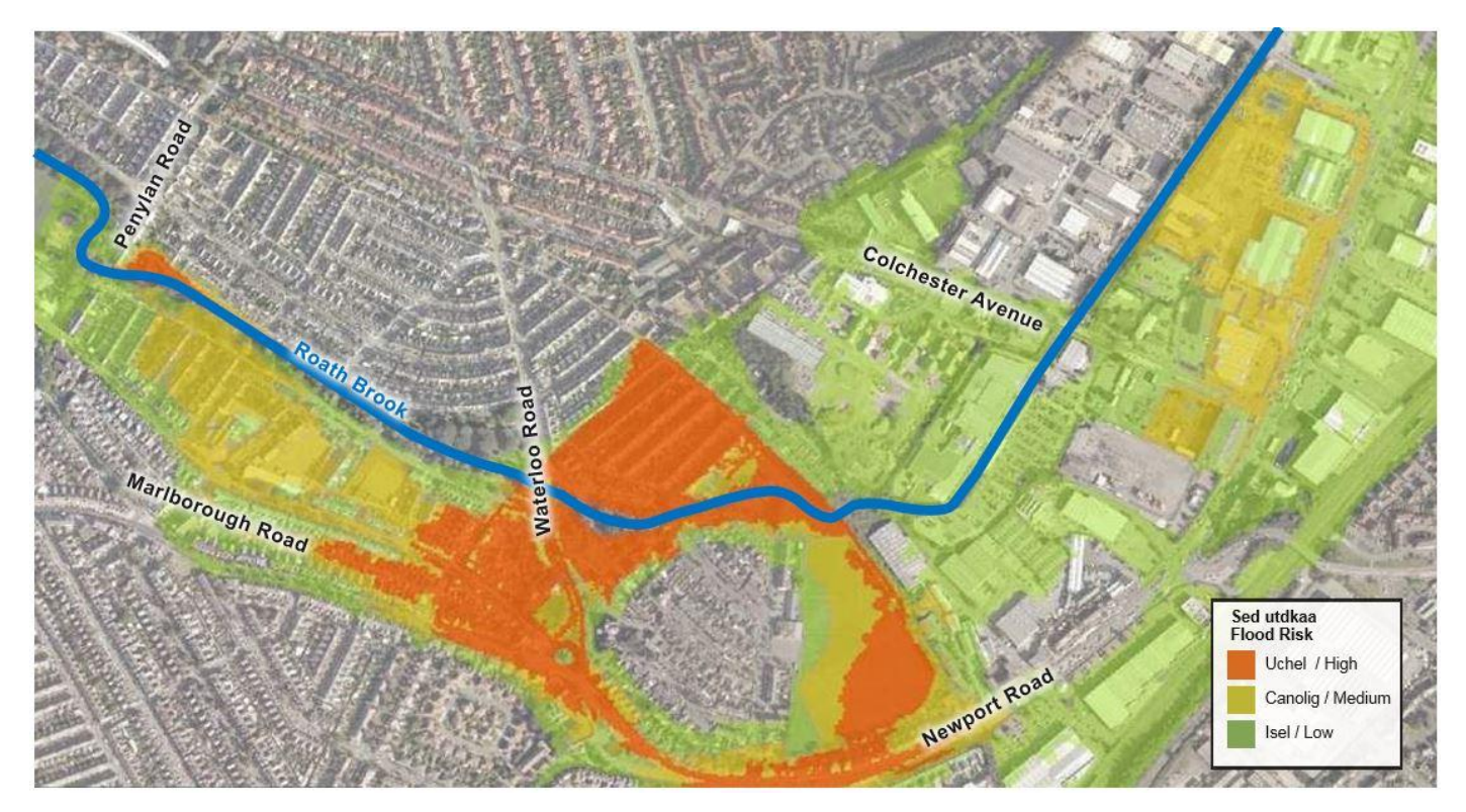
Figure 2. Roath flood risk area

The Flood Risk Management Scheme (FRMS), which has been in development for over 5 years, aims to reduce the flood risk to over 400 properties (360 residential, 45 business).