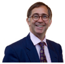
David Melding (Chair) Constitutional and Legislative Affairs Committee Committee for the Scrutiny of the First Minister Welsh Conservatives South Wales Central