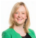
Jayne Bryant AM