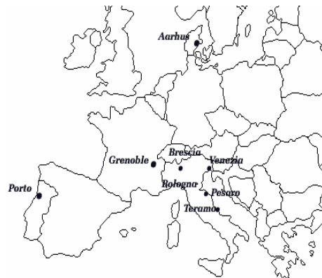
Figure 2: the 8 SHE pilot projects

Each of the 8 pilot projects (Fig. 2) provides concrete examples of integration of sustainability by means of long-term management of land, water, waste, energy and natural resources in social housing and of integrating close participation of citizens in the decision-making phases of urban management.