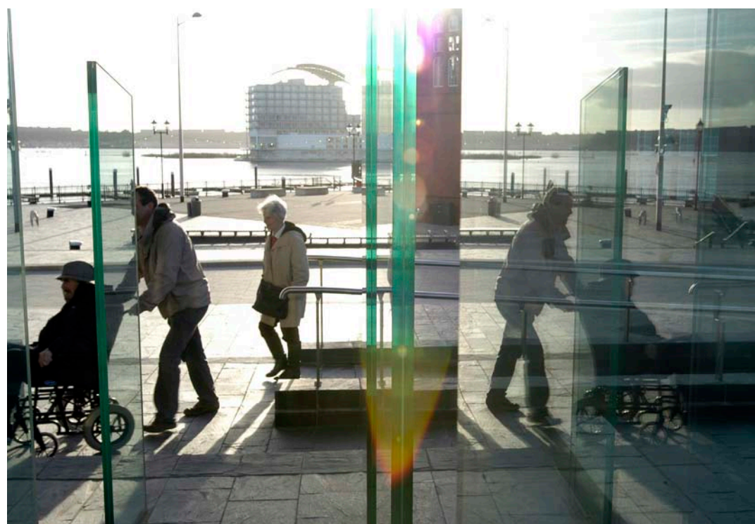
Visitors at the Senedd

Following consultation with the local Sikh community, we developed guidelines to enable Sikh visitors who carry a kirpan ceremonial blade to enter the Assembly estate. Visitors can surrender their kirpan for a substitute, miniature version to use for the duration of their visit in the building.