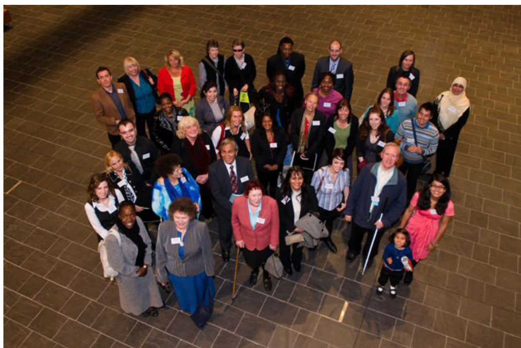
Participants on the Step Up Cymru Mentoring Scheme