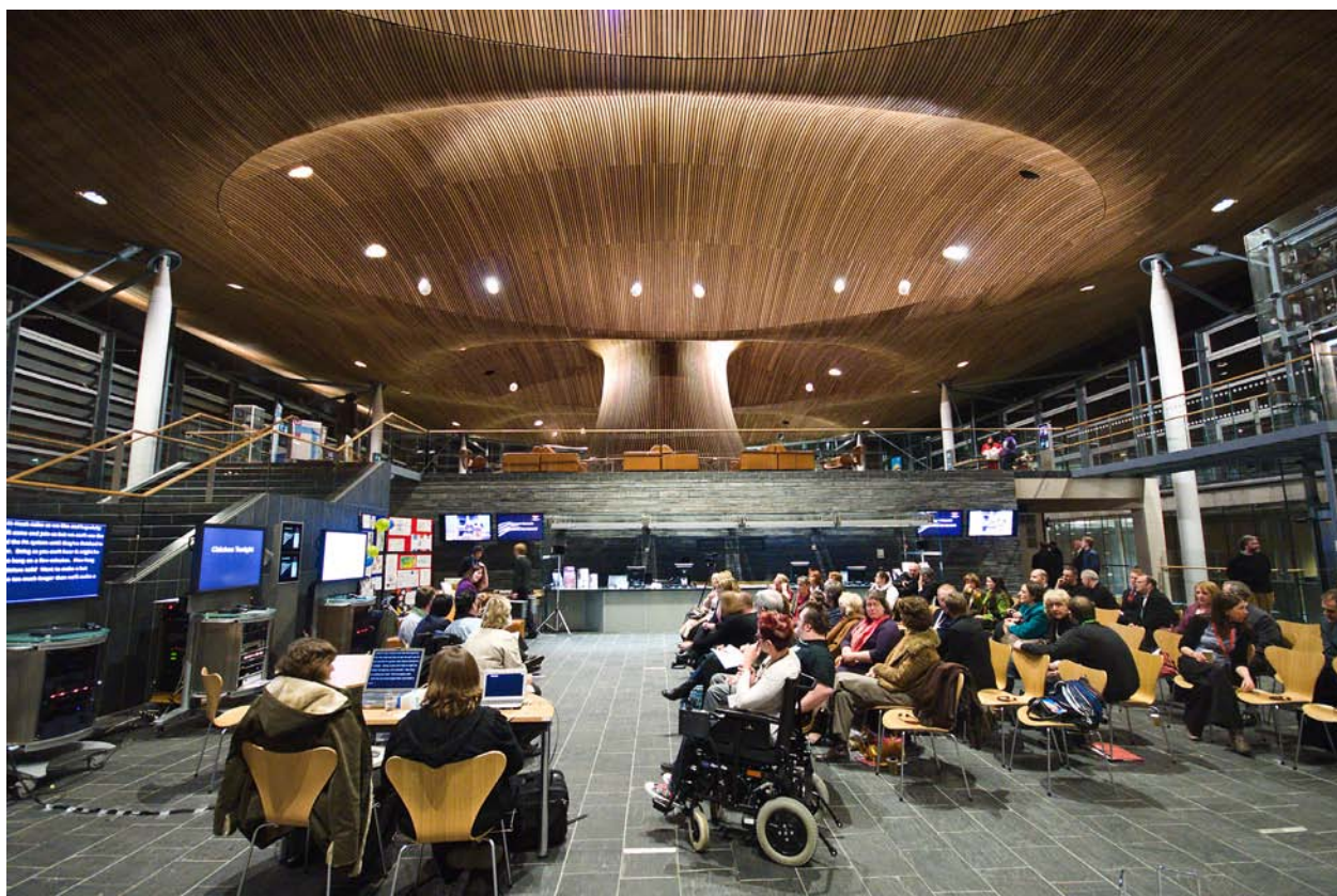
2008 IDDP event in the Senedd

“Excellent support services provided for IDDP. You gave brilliant support throughout the day and made sure all our needs were taken care of.”