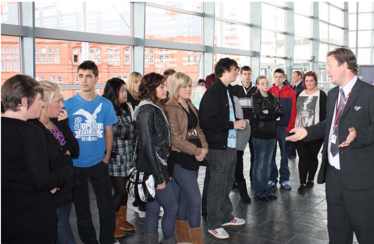
Staff at the National Assembly for Wales