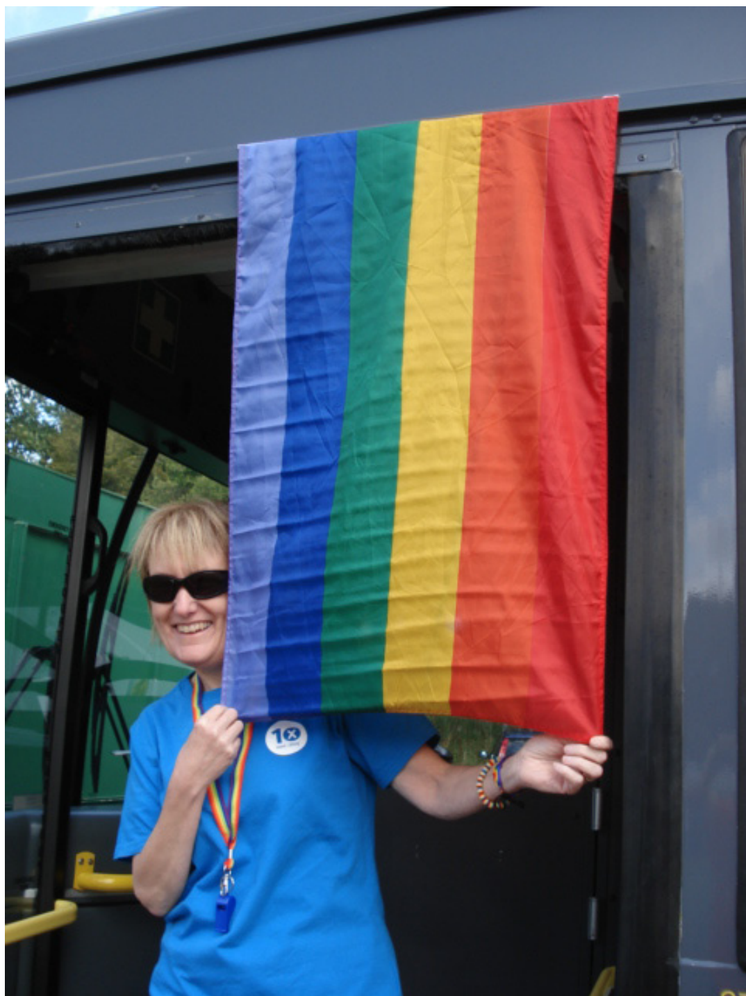
A member of our LGBT staff network on the Assembly Outreach Bus at the Cardiff-Wales Mardi Gras 2009

For the first time, the National Assembly was present at the Cardiff-Wales Mardi Gras. Staff from the Assembly's Events team, Equality and Access team and members of our LGB&T Staff Network were in attendance to welcome visitors onto our Outreach Bus, to inform them of the role and work of the Assembly and to explain what support is available to a lesbian, gay, bisexual or trans employee of the Assembly.