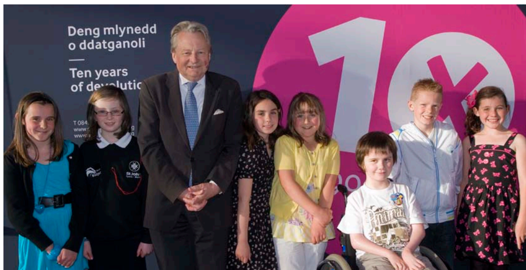
The Presiding Officer meets young people on 12 May 2009

To mark 10 years since the inaugural Plenary meeting of the National Assembly for Wales, children from across Wales born on 12 May 1999 were offered the opportunity to celebrate their birthdays in style at the Senedd. Children from Carmarthen, Neyland, Wrexham, Swansea, Cardiff, Newport and Tywyn joined Assembly Members past and present to mark this special day.